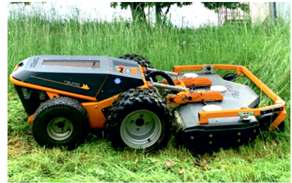
Electric Track Mower