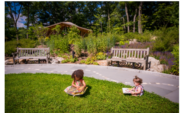
Central Lawn & Paved Walk