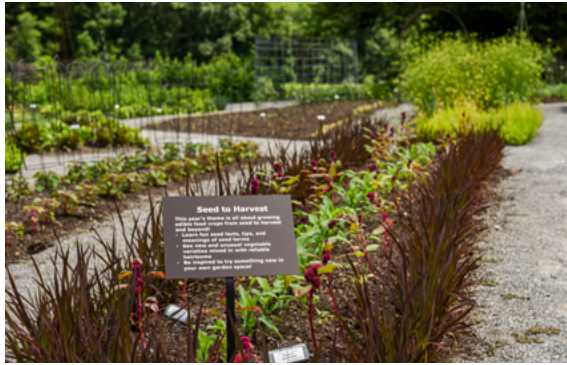
Vegetable Garden Bed