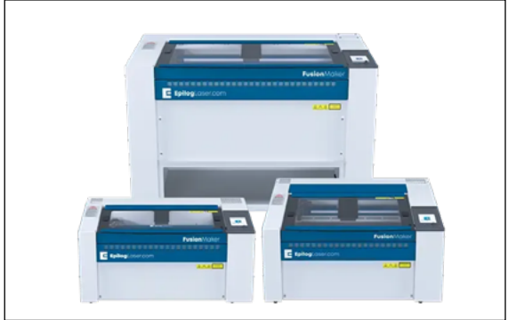
Fusion Maker Engraver Machines