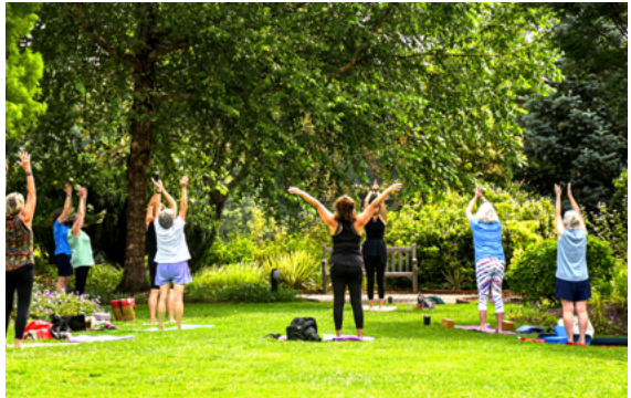
Adult Yoga Program