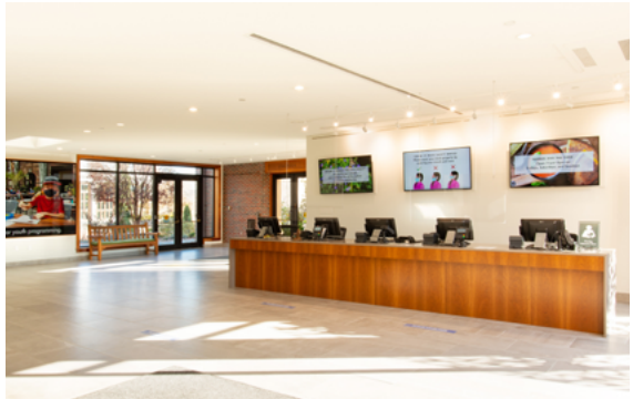
Visitor Center Lobby