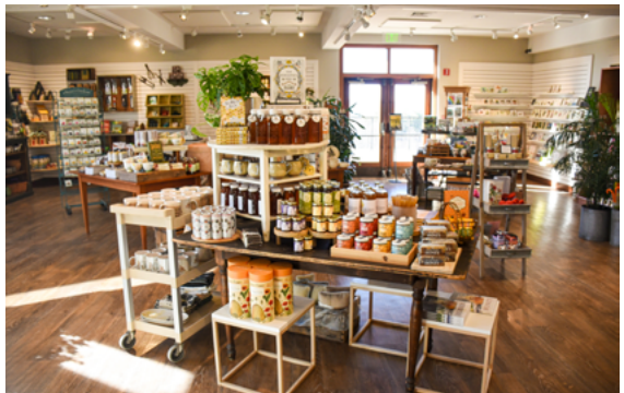
The Garden Shop