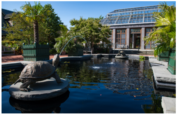
The Winter Garden