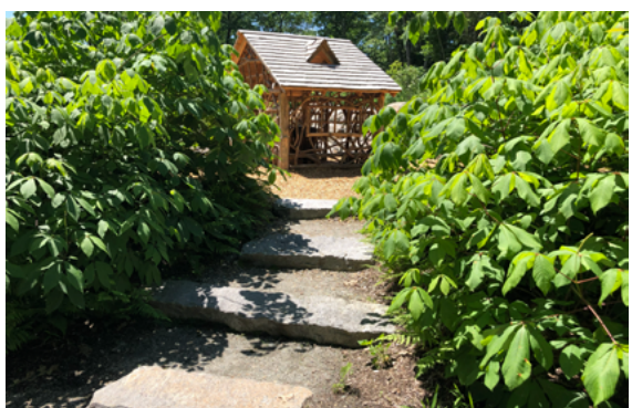
Ramble Shortcut Path