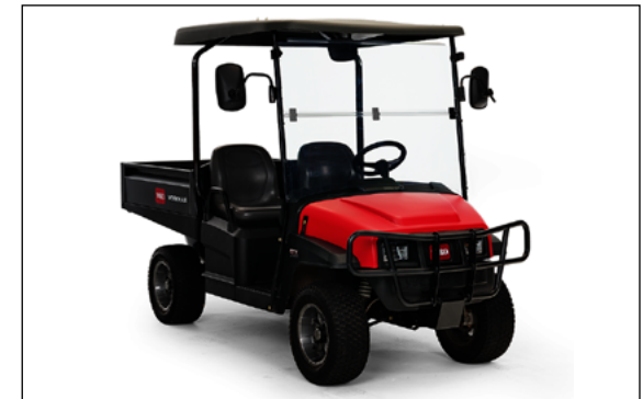
Electric Utility Vehicle