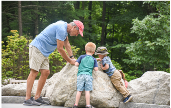
Exploring the Ramble