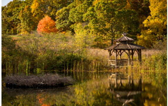
Wildlife Garden Rustic Pavilion