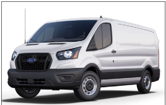
Ford Shuttle Van