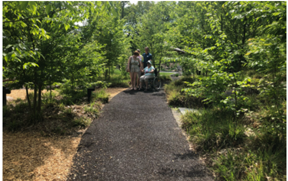
Hornbeam Hill Pathway