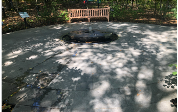
Pliny's Fountain Terrace