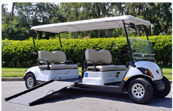
Accessible Limo Cart