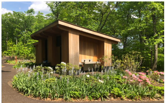
Education Storage and Family Facilities